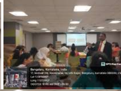
Bengaluru, Karnataka, India T1, Sarvaathma Hall, Kuvempu, Bengaluru, Karnataka 560008, India Lat: 12.679447 Long: 77.627911 00:00:04 10:41 AM GMT +05:30