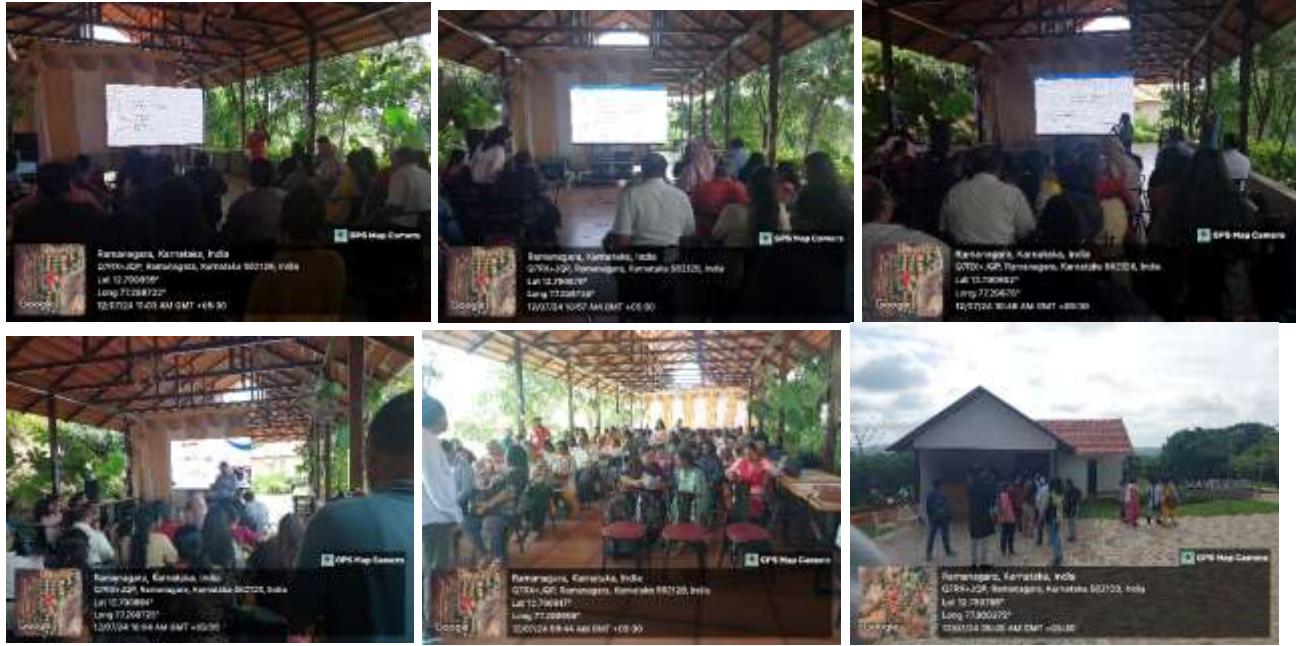
Strategic Meet: Punashchetana 2024-Faculty Refresher Program; Date: 12/07/2024 Area Presentation on Contribution Index & Targets; Venue: Ravishing Retreat Resort, Opp to Kaggalappa Temple Channal Road, Manchanabele Road, Harisandra, - 562128