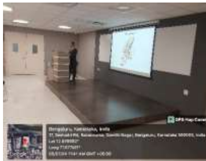
Bengaluru, Karnataka, India T1, Sarvaathma Hall, Kuvempu, Bengaluru, Karnataka 560008, India Lat: 12.679447 Long: 77.627911 00:00:04 10:41 AM GMT +05:30