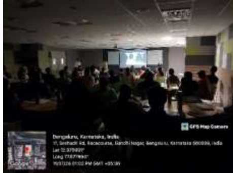
Session Photos of Punashchetana 2024 Event: Punashchetana 2024-Faculty Refresher Program; Date: 2/07/2024 – 15/07/2024; Venue: CMS Business School, Sheshadri Road, Gandhi Nagar, Bengaluru – 560009.