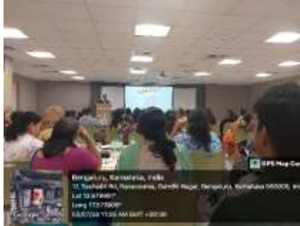
Bengaluru, Karnataka, India T1, Sarvaathma Hall, Kuvempu, Bengaluru, Karnataka 560008, India Lat: 12.679447 Long: 77.627911 00:00:04 10:41 AM GMT +05:30