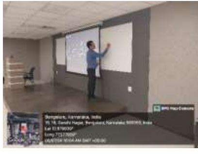
Bengaluru, Karnataka, India T1, Sarvaathma Hall, Kuvempu, Bengaluru, Karnataka 560008, India Lat: 12.679447 Long: 77.627911 00:00:04 10:41 AM GMT +05:30