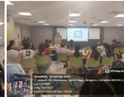
Bengaluru, Karnataka, India T1, Sarvaathma Hall, Kuvempu, Bengaluru, Karnataka 560008, India Lat: 12.679447 Long: 77.627911 00:00:04 10:41 AM GMT +05:30