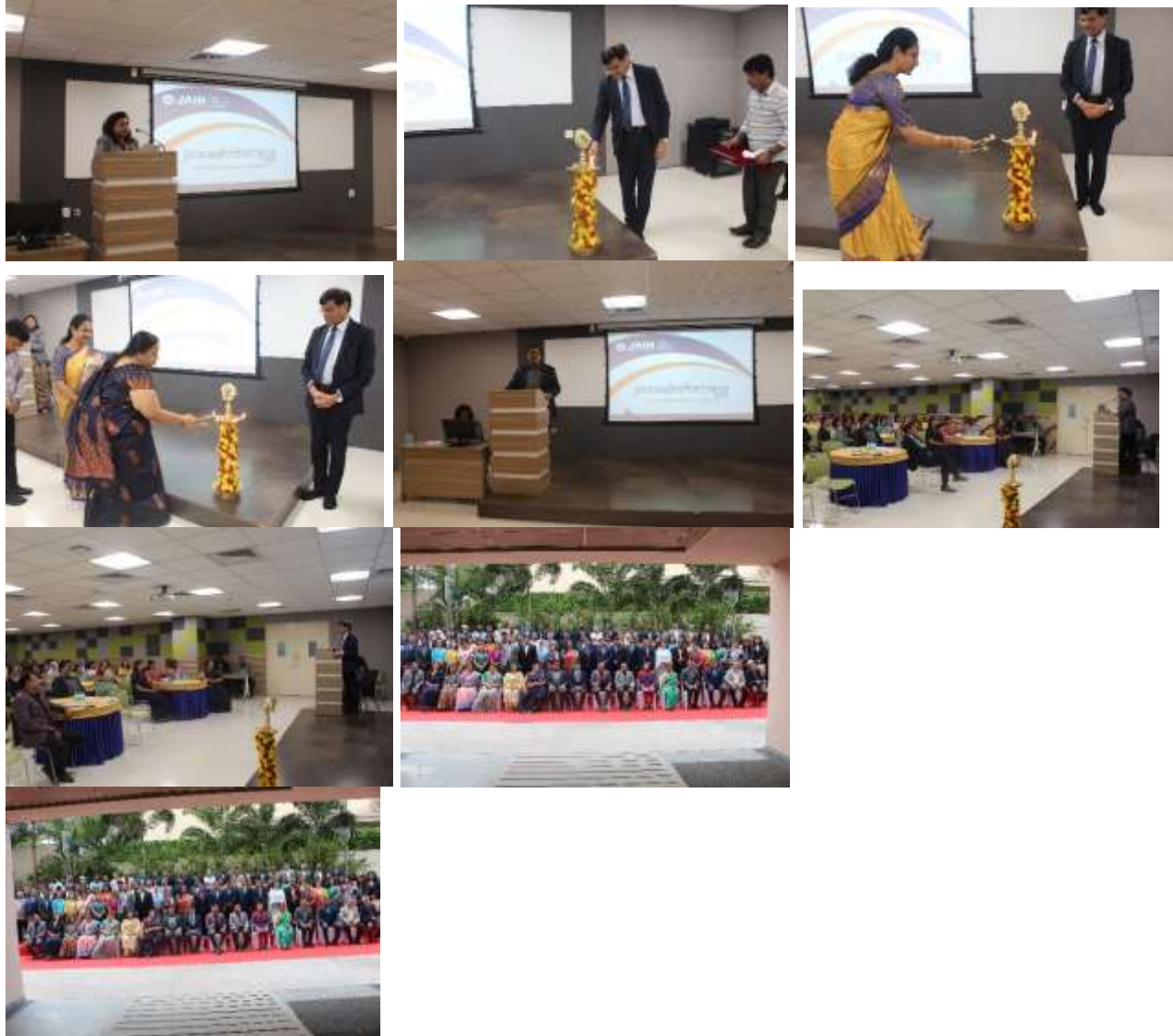
Inauguration of Punashchetana 2024 Event: Punashchetana 2024-Faculty Refresher Program; Date: 2/07/2024; Venue: Seminar Hall-5, CMS Business School, Sheshadri Road, Gandhi Nagar, Bengaluru – 560009.