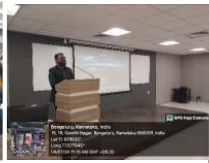
Bengaluru, Karnataka, India T1, Sarvaathma Hall, Kuvempu, Bengaluru, Karnataka 560008, India Lat: 12.679447 Long: 77.627911 00:00:04 10:41 AM GMT +05:30