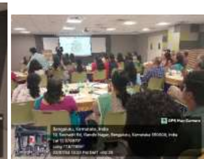
Bengaluru, Karnataka, India T1, Sarvaathma Hall, Kuvempu, Bengaluru, Karnataka 560008, India Lat: 12.679447 Long: 77.627911 00:00:04 10:41 AM GMT +05:30