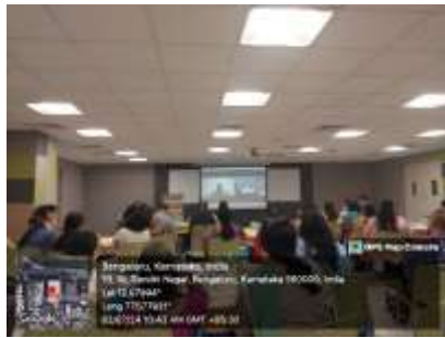
Bengaluru, Karnataka, India T1, Sarvaathma Hall, Kuvempu, Bengaluru, Karnataka 560008, India Lat: 12.679447 Long: 77.627911 00:00:04 10:41 AM GMT +05:30