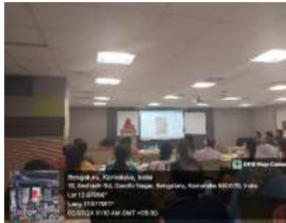
Bengaluru, Karnataka, India T1, Sarvaathma Hall, Kuvempu, Bengaluru, Karnataka 560008, India Lat: 12.679447 Long: 77.627911 00:00:04 10:41 AM GMT +05:30