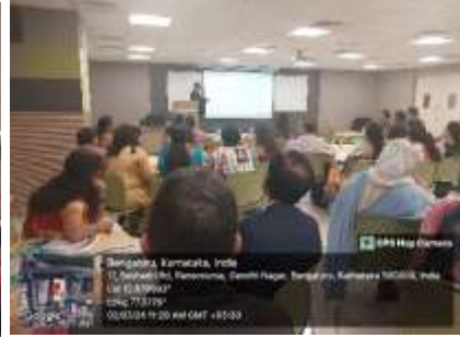
Bengaluru, Karnataka, India T1, Sarvaathma Hall, Kuvempu, Bengaluru, Karnataka 560008, India Lat: 12.679447 Long: 77.627911 00:00:04 10:41 AM GMT +05:30